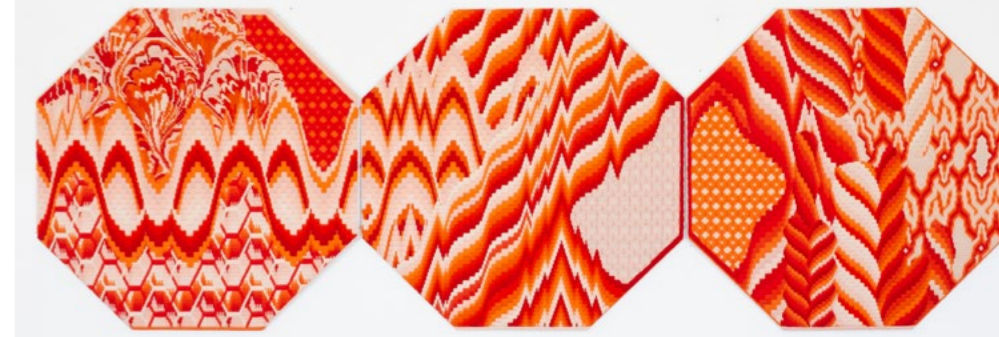
Cecilia Charlton | Fire Matter | Earth Series | Hand-embroidered wool yarn on canvas over panel

Evoking psychedelia of the late 60's, the colours and patterns created by marbling inspire. Laura Bethan Wood's Meisin Cabinet is dressed in bespoke Alpi wood veneer, the undulating motif and palette accentuating its curved form. Vibrant stucco-marble imitates marbling as pattern and colour flow and blend in The Cloud table by Uchronia. To similar effect, psychedelic colour and composition are created using hand embroidery in Cecilia Charlton's Earth Series.