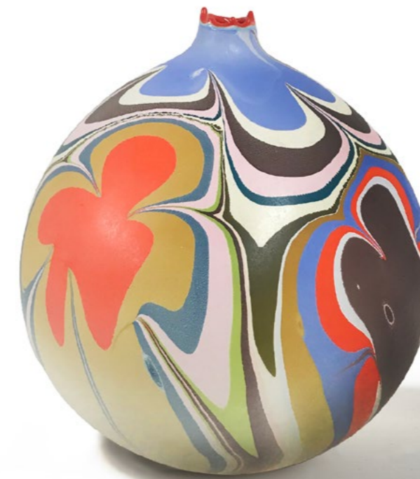
Elyse Graham | Hydro Vessels | Flower Series | Cast plaster and resin, marbled finish