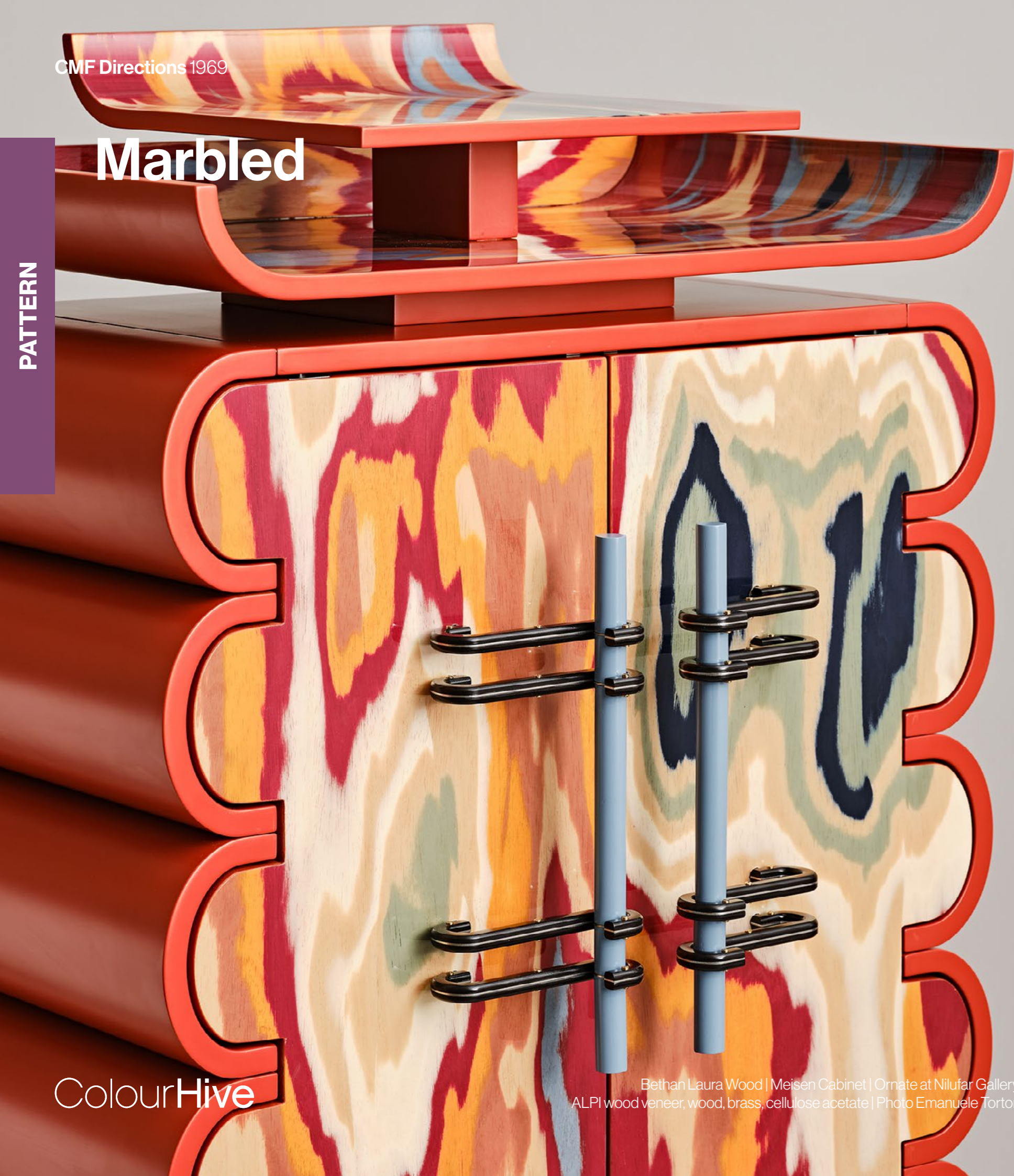
Bethan Laura Wood | Meisin Cabinet | Ormate at Nilufar Gallery | ALPI wood veneer, wood, brass, cellulose acetate

Evoking psychedelia of the late 60's, the colours and patterns created by marbling inspire. Laura Bethan Wood's Meisin Cabinet is dressed in bespoke Alpi wood veneer, the undulating motif and palette accentuating its curved form. Vibrant stucco-marble imitates marbling as pattern and colour flow and blend in The Cloud table by Uchronia. To similar effect, psychedelic colour and composition are created using hand embroidery in Cecilia Charlton's Earth Series.