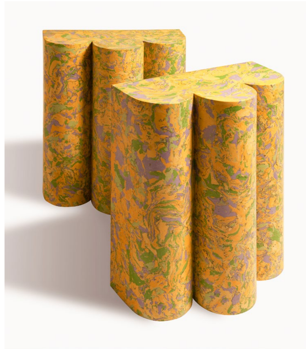
Uchronia | Cloud | Wave collection | Stucco-marble